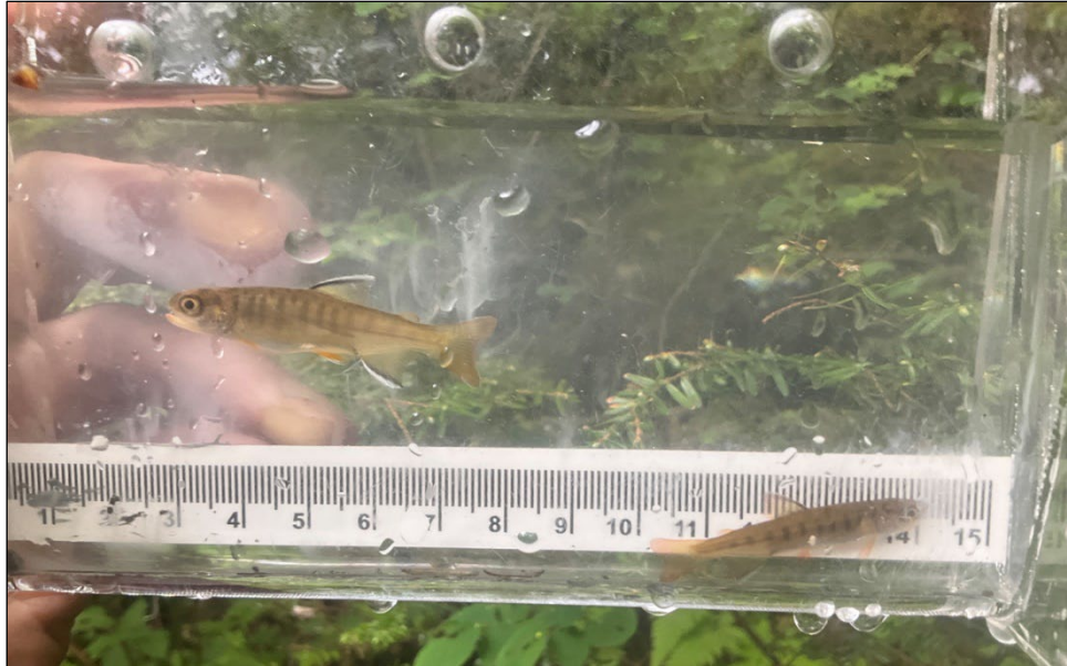
Figure 1.—Juvenile coho salmon captured at waypoint 280.