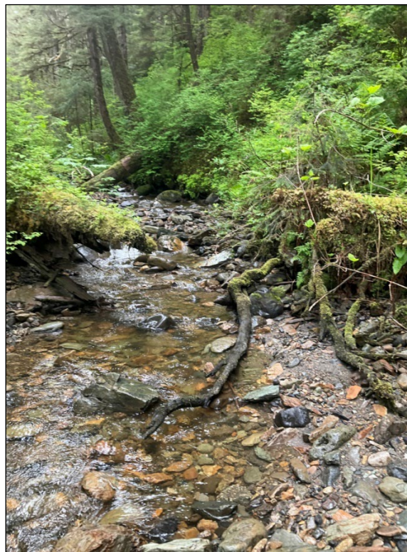
Figure 3.—Channel at waypoint 290.