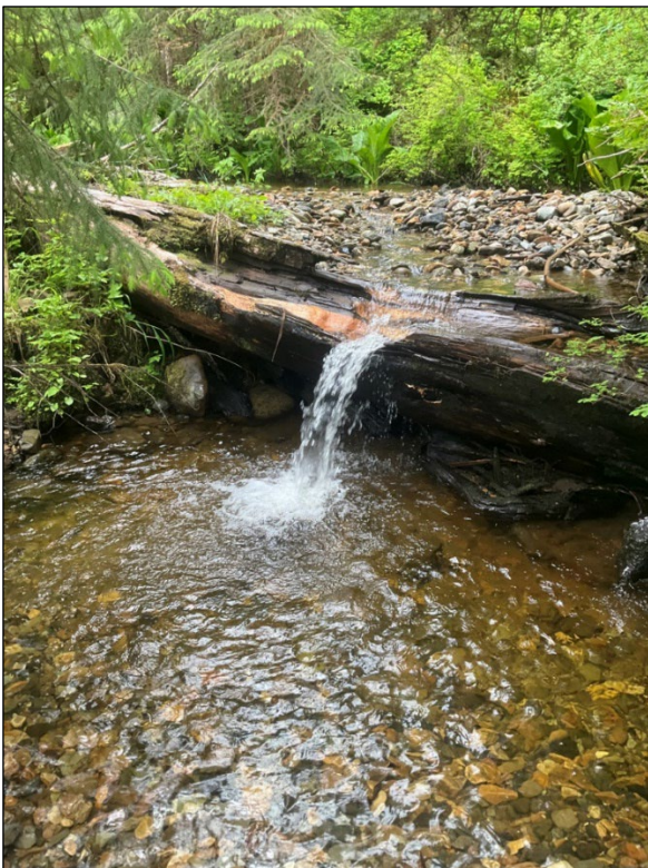
Figure 2.—Channel at waypoint 281.